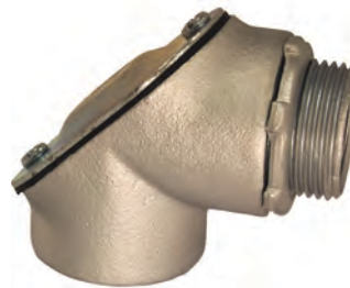
Male to Female