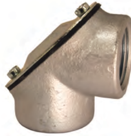
Female to Female